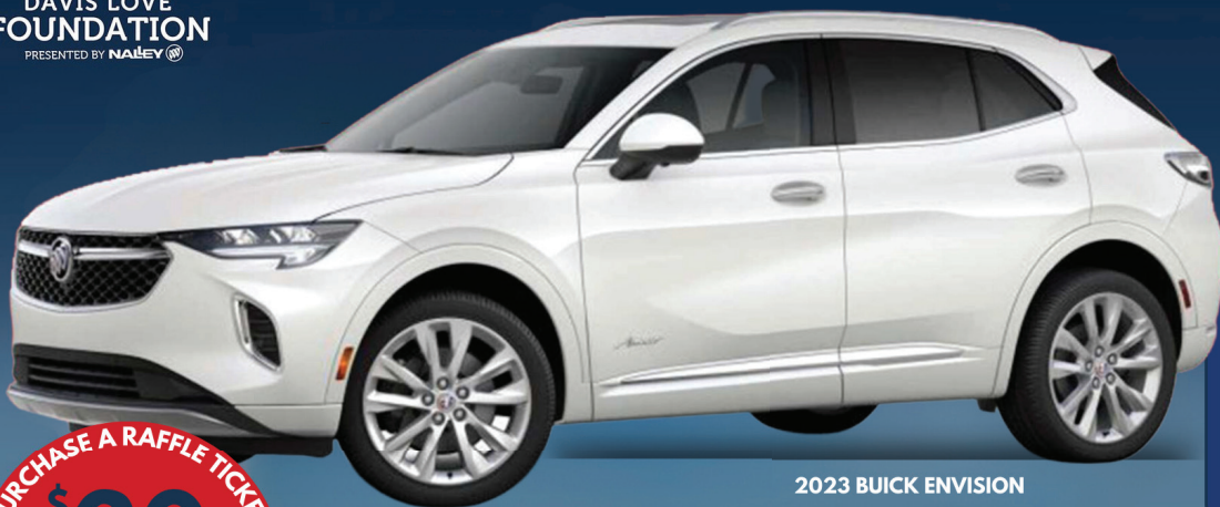
2023 BUICK ENVISION

SHARE THE LOVE AND YOU COULD WIN A BRAND NEW CAR!