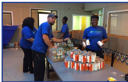
Integral Properties-Ashley Midtown packed emergency food boxes for the Mobile Food Pantry program.