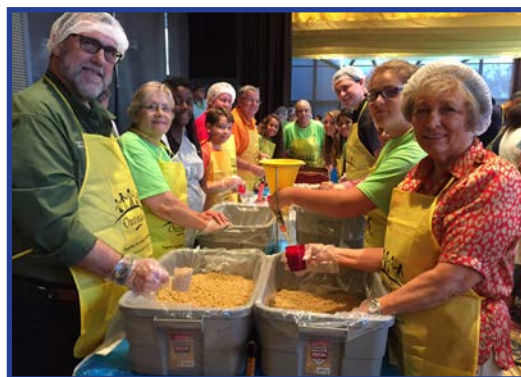
Volunteers from Reidsville UMC packing pasta during the Southern Legislative Conference "Campaign for Hunger".

Agape Empowerment Ministries, Armstrong State Univ, Coastal Center for Developmental Services, Columba House, Effingham Youth Camp, First UMC Church, GAP/ Banana Republic, Girl Scouts, Good Shepard Lutheran, Greater Mt. Bethel Holiness Church, Ladies of Leisure, Messiah Lutheran Church, Old St Paul's Church, Pinyan Company, Roswell UMC, Savannah-Chatham Metro Police Dept, Savannah Early College, Savannah State, Sea Island Bank, South Effingham ROTC, Target, UPS, Victoria Runs, Wells Fargo, Yancey Bros, Youth Works.