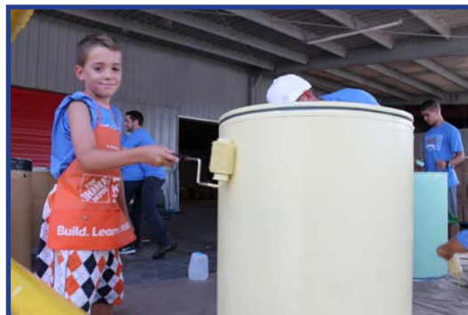
Vivint volunteers painted barrels in preparation for Fall food drives.