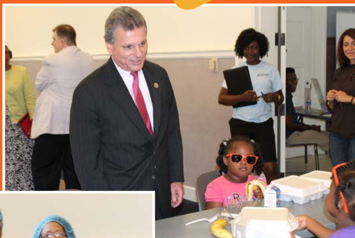
Congressman Buddy Carter visited the children at Bull Street Library.