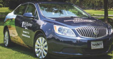
2015 Buick Verano. Actual vehicle shown.

DLF FRIENDS of the FOUNDATION CHALLENGE Presented by NALEY