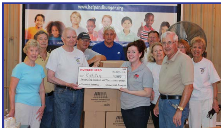
Skidaway Island Rotary Club in their Aha Moment making a donation to fund a Kids Cafe site and volunteering to pack food boxes for seniors.

2501 East President Street Savannah, GA 31404 Phone: 912.236.6750 www.helpendhunger.org