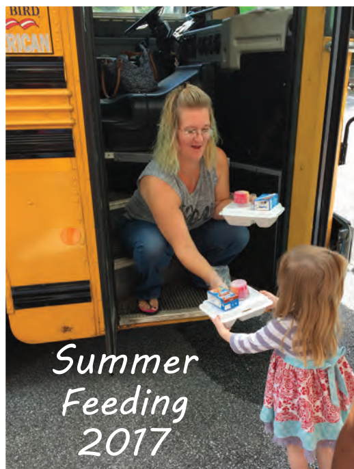
Summer Feeding 2017