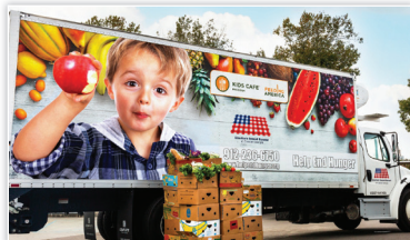
America's Second Harvest donation truck.