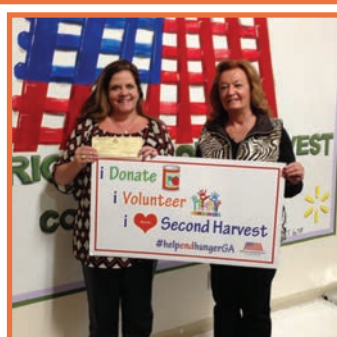
Antique Car Club