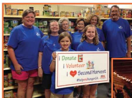
St. Simons First Presbyterian Church

Antique Car Club, Brunswick Cellulose, Del Sur Artisan Eats, St. Simons First Presbyterian Church, GA Drama Club, Horse Stamp Inn, Newcomers Club, Pirates of the Spanish Main, Plum Creek Timber Co., and Richs.