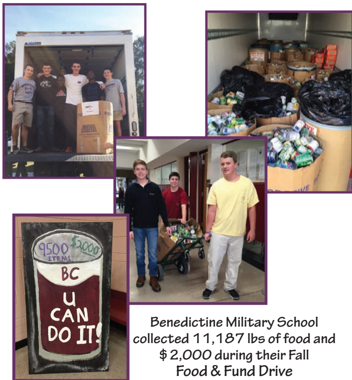
Benedictine Military School collected 11,187 lbs of food and $2,000 during their Fall Food & Fund Drive