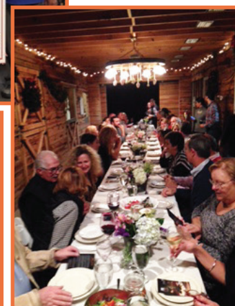
Del Sur Artisan Eats at Horse Stamp Inn