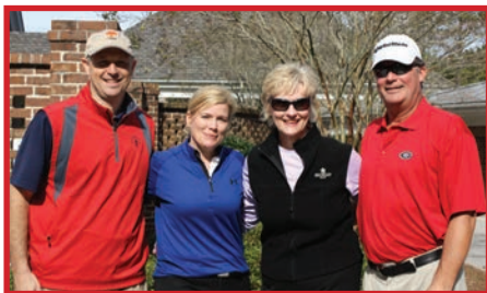
Sea Island Bank Foursome