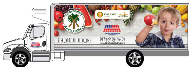
Rendering of the new Kids Cafe truck made possible by the Lowcountry Annie Oakleys